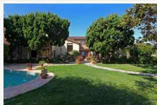
Roger Revelle Home